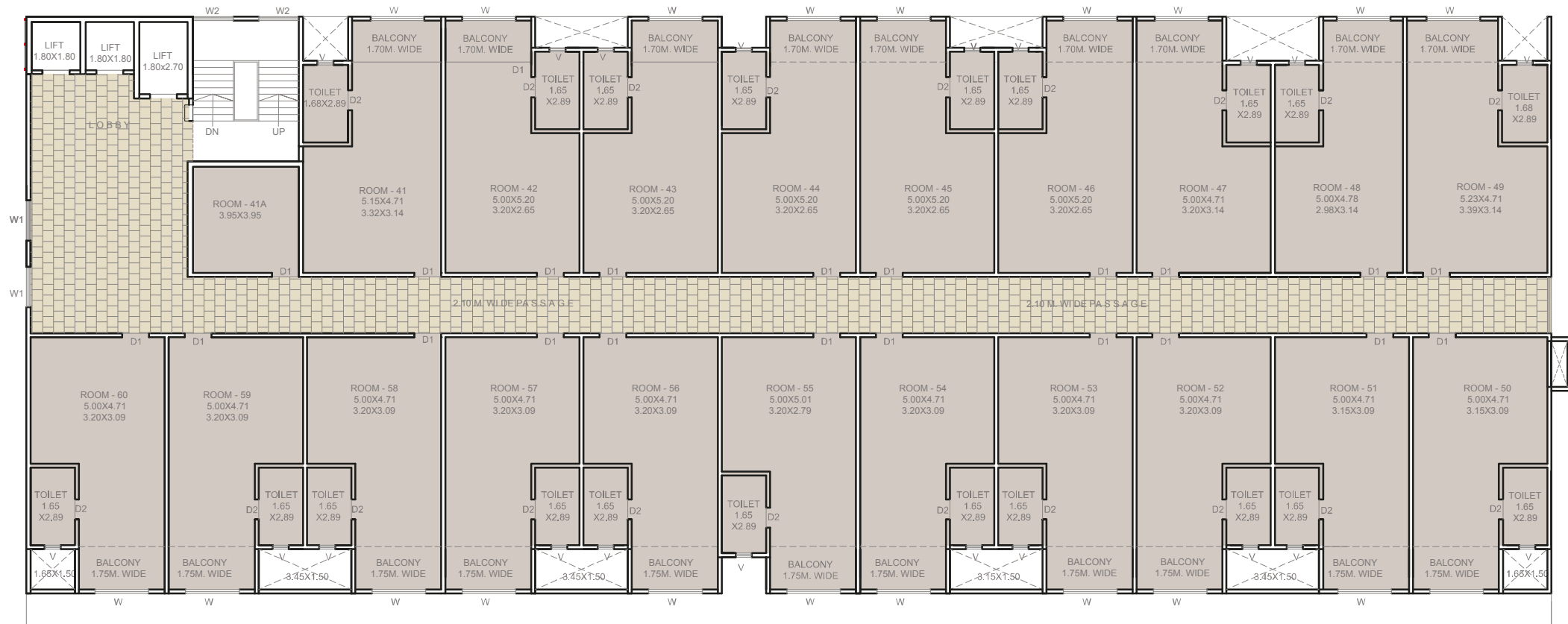
Fifth Floor Plan | SBH Wakad