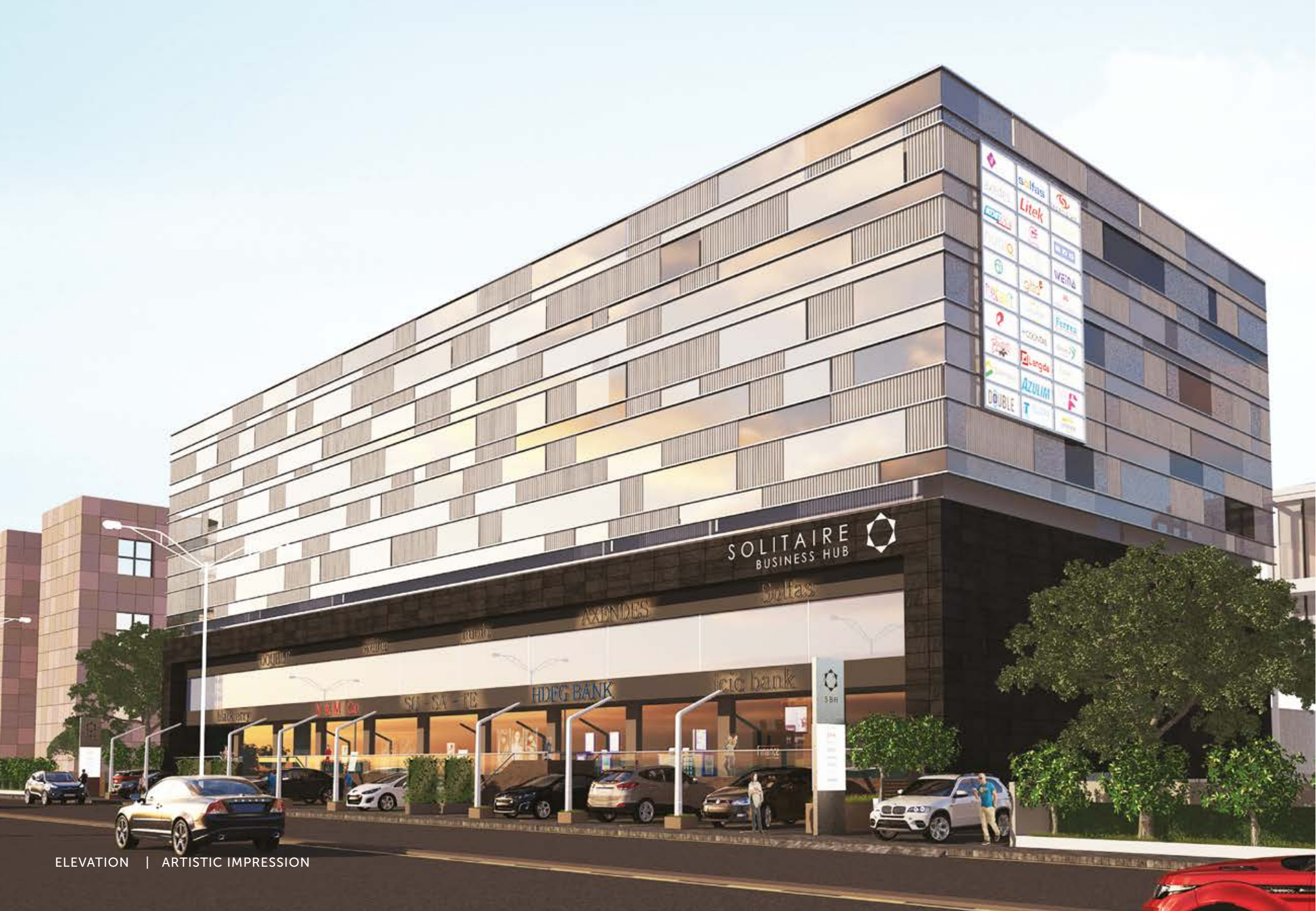
ELEVATION | ARTISTIC IMPRESSION