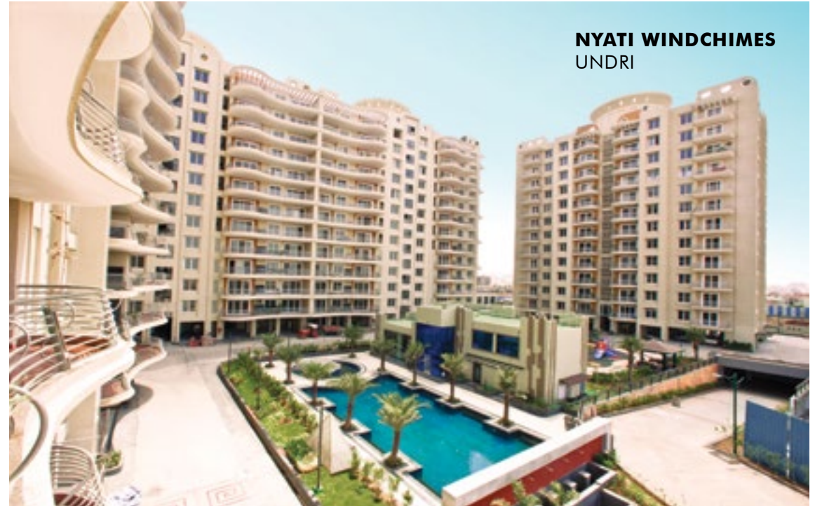
NYATI WINDCHIMES UNDRI