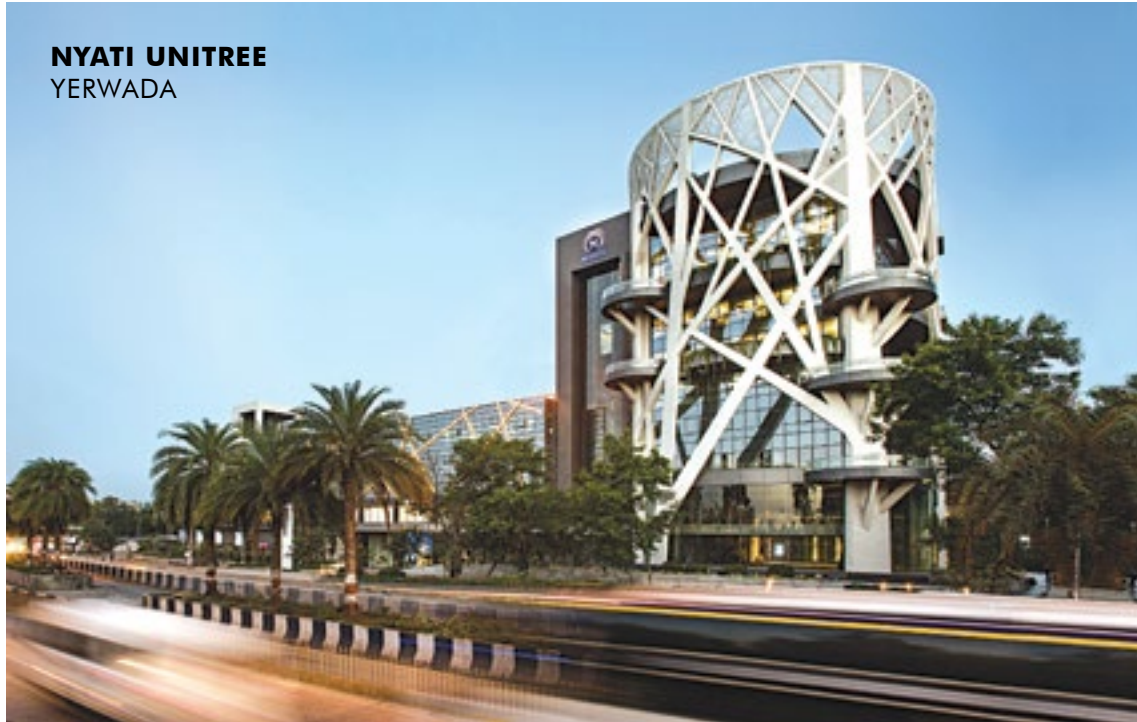
NYATI UNITREE YERWADA