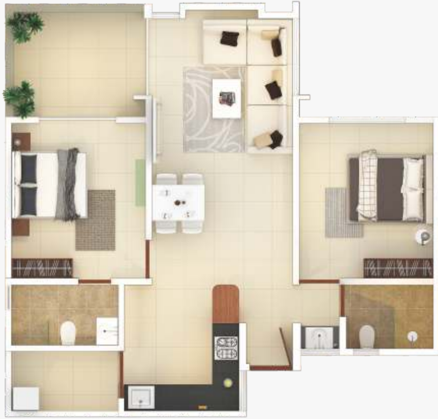
Typical 2 BHK Type 1