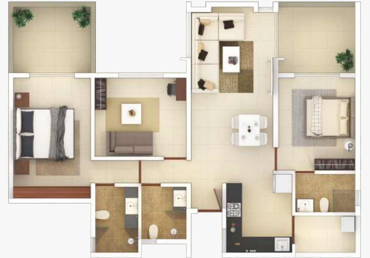
Typical 3 BHK