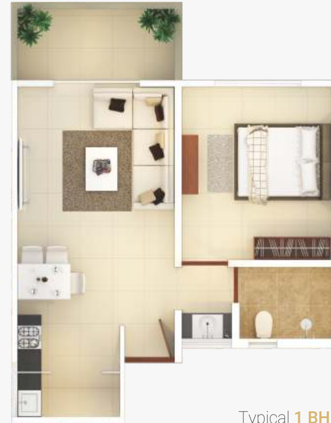
Typical 1 BHK