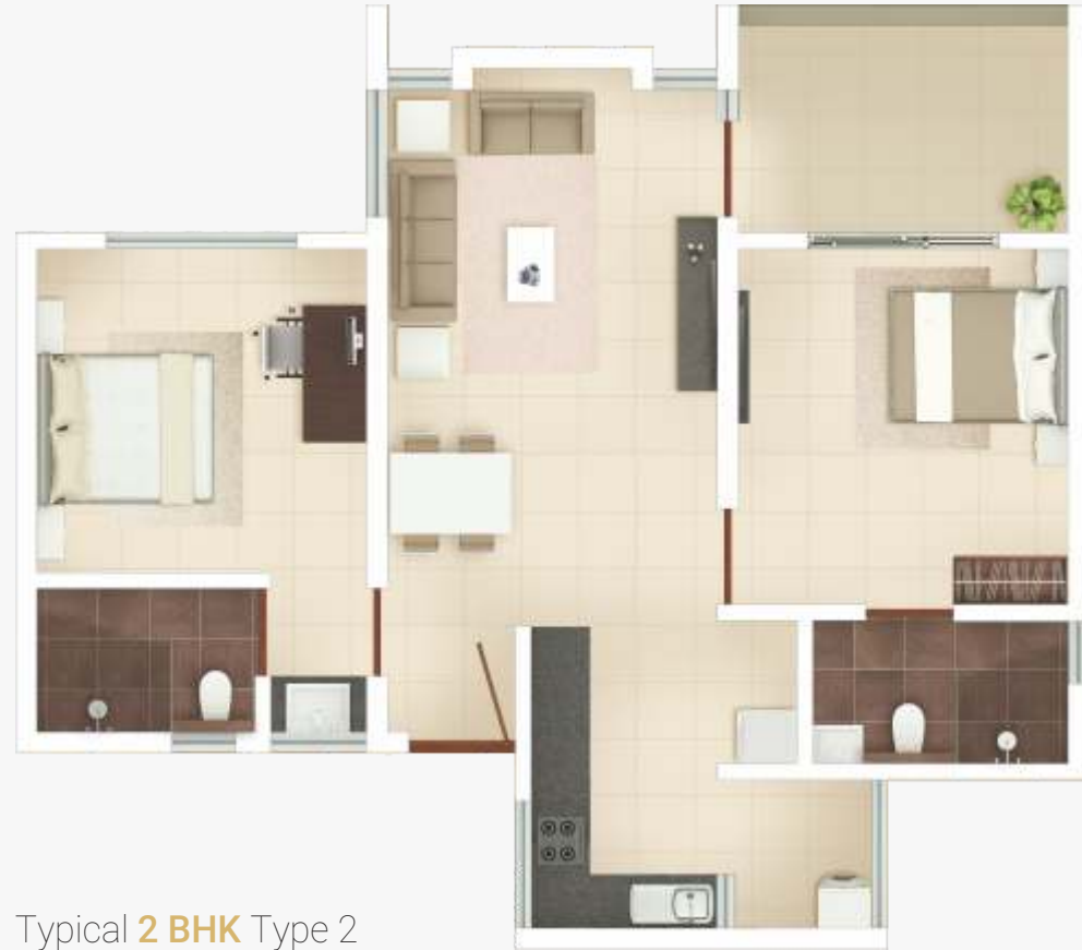
Typical 2 BHK Type 2